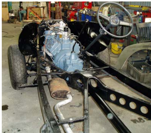
C11ADF “Blitz Buggy”