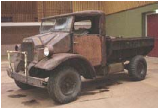
F8 in Holland, before delivery to Norfolk

8cwt Canadian Ford. Paul and Clinton finally got hold of their long sought after 8 cwt CMP Ford. They travelled to Holland to see it, but, due to the time difference, rough seas and dubious directions, they only had an hour to make up their minds. The Ford stood in a very gloomy shed with poor lighting, making it difficult to inspect, but it seemed to be nearly complete and sound, although the back body had been enlarged. It was a little too early (1940, not 1941), but such is the rarity that a deal was quickly done. It turned up in a cold and snowy Norfolk just after Christmas in a big box lorry. Peter arrived from the heat of Saudi Arabia at exactly the same time and rushed straight off to meet the lorry in a lay-by: not even time for a celebratory glass of fizzy apple juice. The Ford rolled straight out of the lorry onto a big trailer Clinton had borrowed, before Peter towed it to Clinton’s garage. Unfortunately, no-one took any photographs of the comic efforts to offload it up the drive, sliding around on the snow and ice. Clinton knew that it was not a good idea to start work on the F8 when the 3 tonner still had so much to do, but within a week, the temptation became too much and he started dismantling it in his spare time. It is a big job, with the vehicle not being in such a good condition as hoped, but at least Paul and Clinton will have something to do when the 3 tonner is finished.